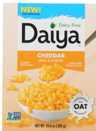
Daiya Deluxe Mac & Cheese selected varieties