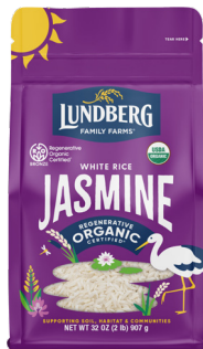
Lundberg Family Farms Organic Rice Pouches selected varieties

Rice-obsessed since 1937. We exist to grow the highest quality rice using organic and regenerative farming practices because the health of our bodies and our planet depend on it.