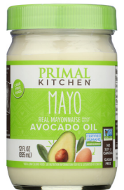
Primal Kitchen Mayo with Avocado Oil selected varieties