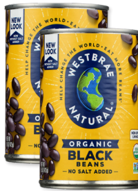
Westbrae Organic Beans selected varieties