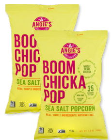
Angie's BoomChickaPop Popcorn selected varieties