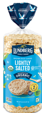
Lundberg Family Farms Organic Rice Cakes selected varieties