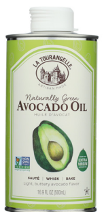
La Tourangelle Avocado Oil