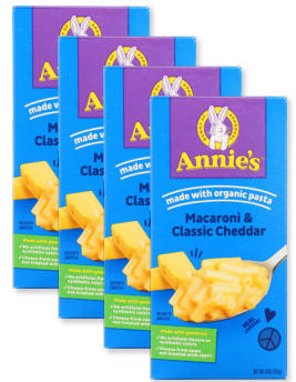
Annie's Mac & Cheese selected varieties