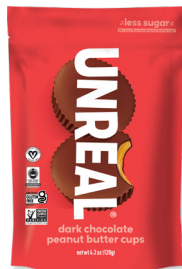
UNREAL Nut Butter Cups selected varieties