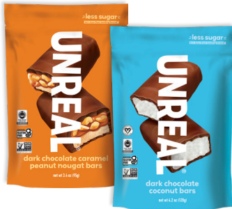
UNREAL Dark Chocolate Bars selected varieties

Enjoy the chocolate snacks you love with 100% real ingredients, no artificial stuff, and way less sugar! From classic treats to satisfying new chocolate covered pretzels and almonds, there's something unreal for every craving.