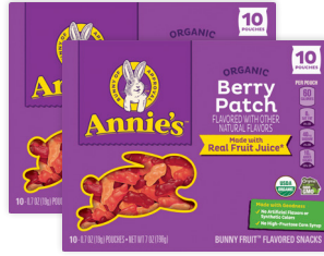
Annie's Organic Fruit Snacks selected varieties