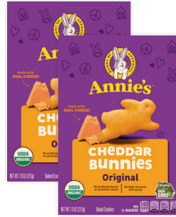
Annie's Organic Bunny Crackers selected varieties