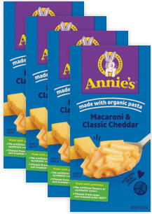
Annie's Mac & Cheese selected varieties