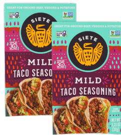
Siete Seasoning selected varieties

Siete is a Mexican-American food brand, rooted in family, that creates delicious, heritage-inspired foods for more people to enjoy—like Grain Free Mexican Wedding Cookies! Bite-sized, crunchy, and sweet, they're just the thing for lunch box packing and midday snacking.