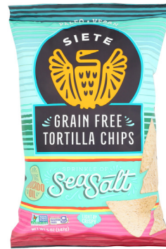
Siete Tortilla Chips selected varieties