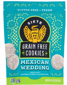
Siete Grain Free Cookies selected varieties